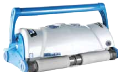
ULTRA MAX G